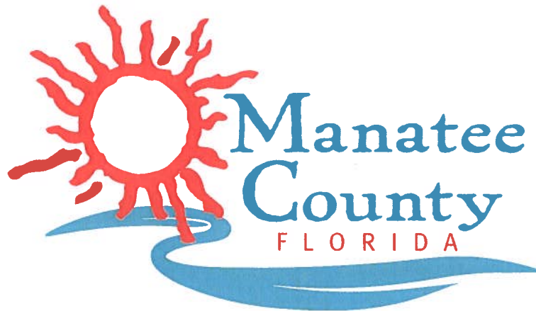
EXHIBIT E RESOLUTION R-22-100